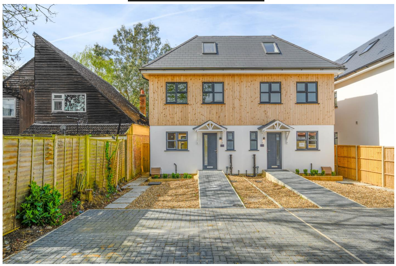
37a Homefield Road Walton-On-Thames Surrey KT12 3RE £650,000